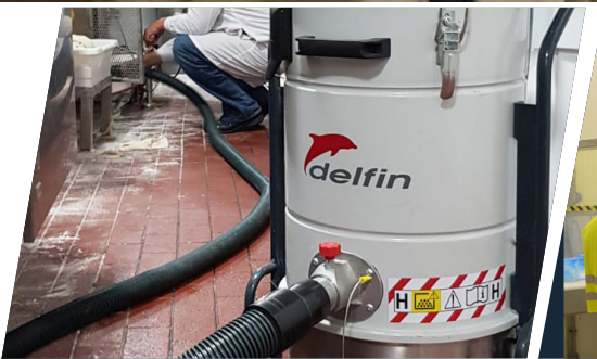
NRTL CERTIFIED VACUUMS FOR COMBUSTIBLE DUST