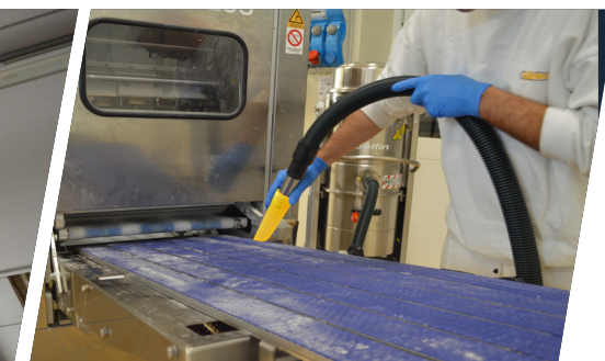
COLOR CODED ACCESSORIES