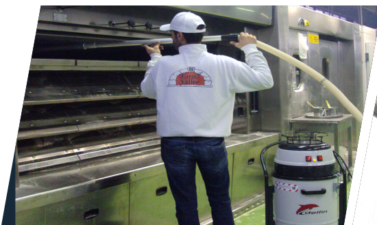
HOT OVEN CLEANING