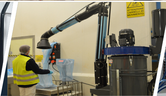
PORTABLE DUST COLLECTION