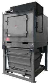
ENGINEERED AND CUSTOMIZED SOLUTIONS