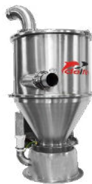
PNEUMATIC CONVEYING SYSTEMS