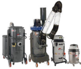
PORTABLE VACUUMS FOR INDUSTRIAL CLEANING

We are a global leader in the manufacturing of industrial vacuum machines, ranging from portable vacuums for industrial cleaning, to central vacuum systems and engineered solutions to pneumatic conveying systems.