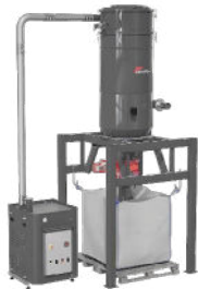
CENTRAL VACUUM SYSTEMS